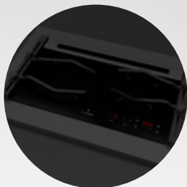
X2 mini C&Y

Tailored to your model. They protect pots and dishes from moving during cooking.